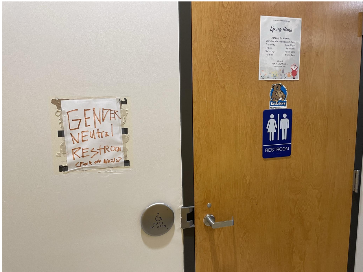
(Jane Bancroft Library)