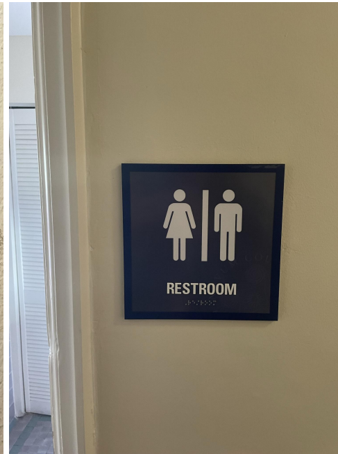
Additional photos of newly-placed ADA-noncompliant signage. (Top Right, Heiser natural sciences building, Top Left: College Hall, Lower Right and Lower Left: Cook Hall)