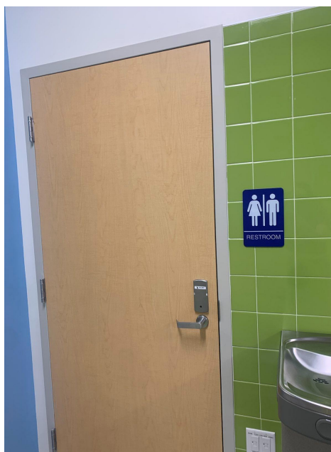
Students made efforts to re-label the restrooms as all-gender, but these were removed as well. (Top: College Hall, Bottom: Heiser Natural Sciences Building)